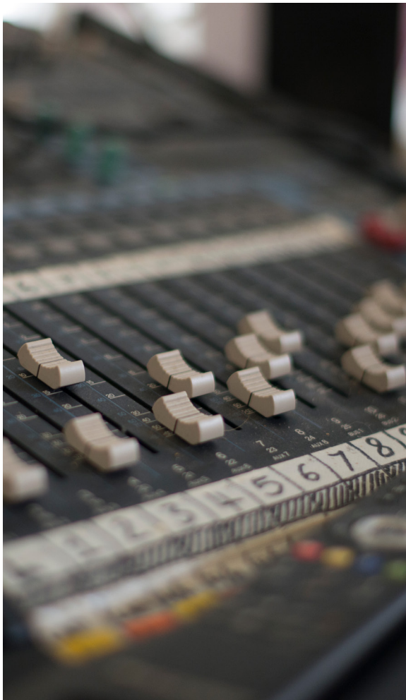
All prices listed are excluding VAT at the current rate.

** depending on the room hired the screen may be a 52" LED or fast fold.